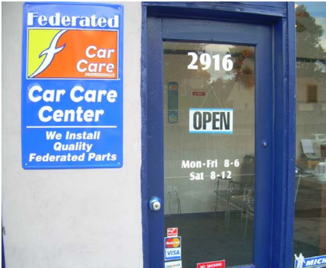
Hours of operation